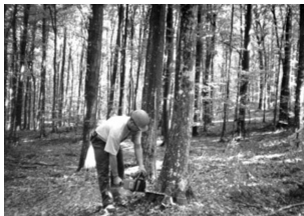
Figure 2 Cutter engaged in felling and processing

The effective time of the tractor E per unit is 21.64 min/m 3 , and of the tractor T 20.67 min/m 3 , which is by 4.5 % lower than the tractor E. Total time consumption per unit of the tractor E is 42.05 min/m 3 , and of the tractor T 35.04 minutes and hence by 7.01 min/m 3 lower. The average daily efficiency of the tractor E is 9.98 m 3 /day, and of the tractor T it is 11.43 m 3 /day. The tractor T skidded on average 1.45 m 3 /day more than the tractor E, which is by 12.7 % more.