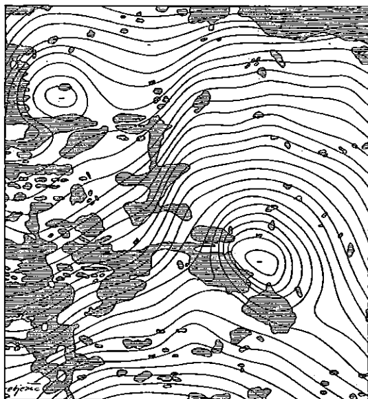
Figure 1: Contours and stoniness of the sample plot in the Čorkova Uvala virgin forest in Plitvice Lakes National Park

According to Seletković (201), the climate of beech-fir forests in Lika and Gorski Kotar is temperate warm-rainy and partially snowy-boreal. As indicated by some estimates, the average annual precipitation in Čorkova Uvala amounts to about 1,600 mm, while the mean annual air temperature is about 7° C. The dominant soil type is brown soil on limestone (calcocambisol) of varying depths (depending on area stoniness), which offers an array of conditions for the growth of forest trees. More shallow soils, melanosol on limestone and dolomite (calcomelanosol) have been identified in higher areas, while cracks and sinkholes contain deep lessivated soils (luvisol). Compared to other soils in the area, luvisol ensures much more favourable growth conditions to forest trees. Stone areas, especially plate-like layers with sporadic very shallow brown soil on limestone or melanosol on limestone provide exceptionally unfavourable conditions for the growth of forest trees (Figures 1 and 2). The virgin forest of Čorkova Uvala extends over 80 ha. Figure 1 shows a sample plot of 1 ha established in 1957. The proportion of stone area in this plot was 19%.