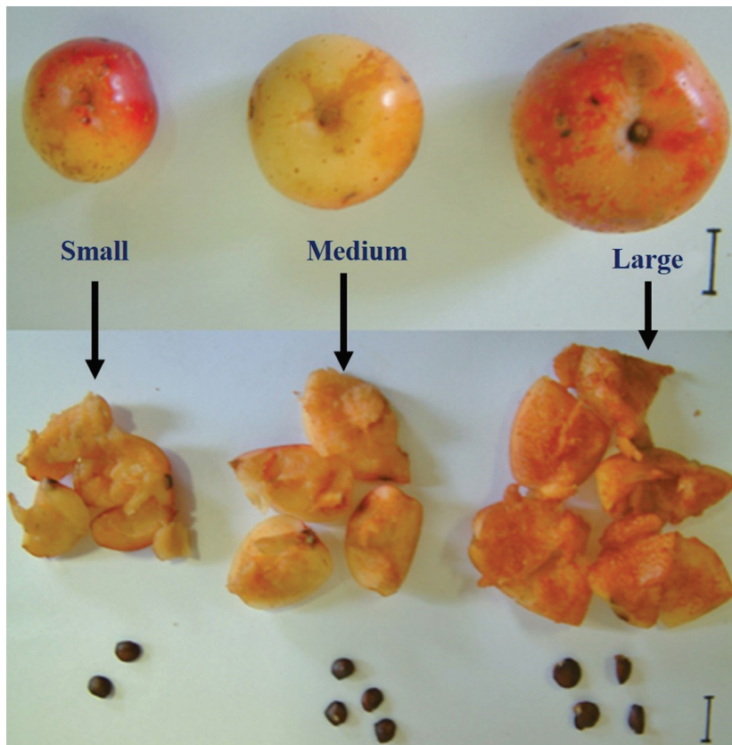
FIGURE 3. Different sizes of fruits of service tree ( S. domestica L.) showing the variations in the number of obtained seeds.

statistically significant ( p \leq 0.0001 ) and higher in large fruits (2.62 seeds) in comparison with medium (1.81 seeds) and small (1.46 seeds) fruits (Figure 3).