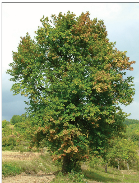
FIGURE 1. Service tree ( S. domestica L.) in Croatian agro-climatic conditions.

many European countries [3]. Croatia is one of the countries where the environmental conditions favor the cultivation of service tree. This species is extensively found in the Mediterranean area, as well as in the continental part of Croatia [4].