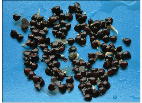
FIGURE 2. Germination of service tree ( S. domestica L.) seeds.

The descriptive statistical data of some morphological characteristics of service tree fruits with different weight is shown in Table 1. Statistically significant differences were determined in length (mm) and width (mm) of the fruits between groups defined by weight ( p \leq 0.0001 ). Small fruits showed statistically significant difference ( p \leq 0.0001 ) having the highest fruit shape index (0.98) in comparison with medium (0.94) and large (0.91) fruits. Therefore, it can be concluded that small fruits had a more round shape. A number of filled seeds in S. domestica L. fruits were