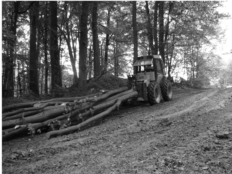
Fig. 1. Ecotrac 55V skidder in thinning.