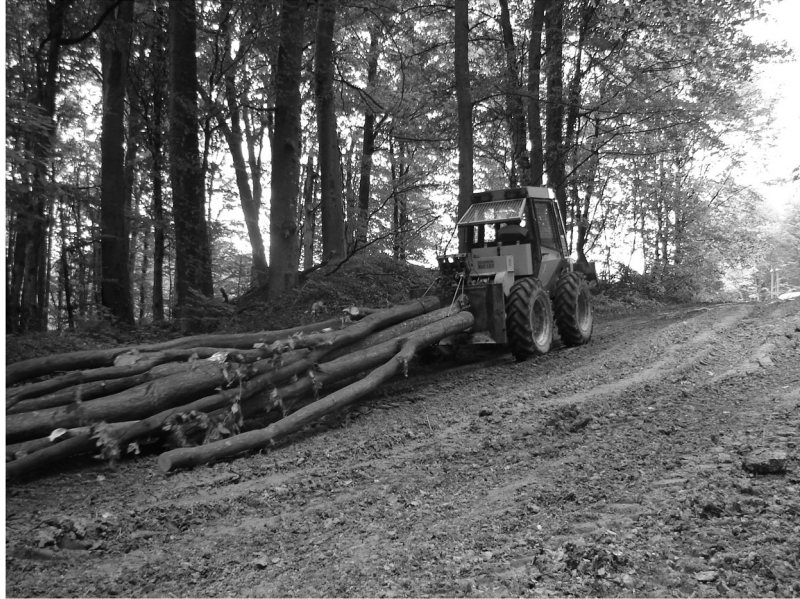
Fig. 1. Ecotrac 55V skidder in thinning.