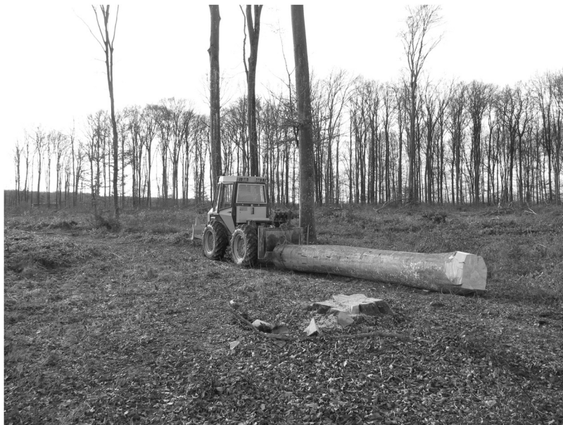
Fig. 2. Ecotrac 55V skidder in regeneration cut.

(2000) and Klvac et al. (2012). The emission factors for the lubricant were selected on the basis of oil types, i.e., fully mineral gear oils, semi-synthetic engine oil, with an 80:20 ratio, and mineral lubricants. The fuel and oil consumptions were determined on the basis of nominal engine power, engine load factor, engine specific fuel consumption, and time of use per output unit, as reported in Picchio et al. (2009).