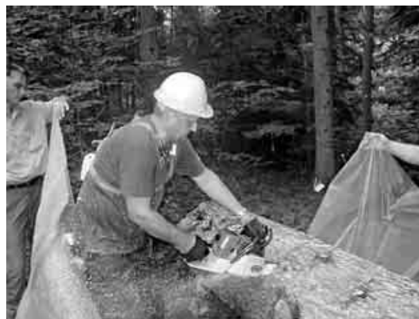
Figure 1 Cutter with attached dust samplers Slika 1. Sjekač s pričvršćenim uređajima za skupljanje uzoraka prašine

The mass concentration of respirable particles and total dust were determined by gravimetric method in compliance with the standard ZH 1/120.41, 1989, by use of personal collectors defined by the standard EN ISO 10882-1:2001. Personal collectors manufactured by Casella (produced in Bedford, UK, 2001) were fixed by straps on the cutter's body so that the suction parts, cyclones equipped with filters were positioned in the breathing zone (Figure 1), and the driving device (electric pump) on its back (Figure 3), so as not to stand in the way of cutting and processing. The separators of non-respirable particle fraction (cyclones) operate in a way similar to the separation of respirable particles in the medium effective (50 %) respiratory system of a healthy adult, with an aerodynamic diameter of 5 µm. The measurement was performed by use of a micro-scale METTLER-TOLEDO MX-5 (produced in Greifensee, Switzerland, 2000) capable of precise measurement and reading of values to 10 -6 gram, with measurement error of ± 10 -4 gram. In the process of sampling, the air flow rate at the suction head was 2 L/min (EN ISO 10882-1:2001).