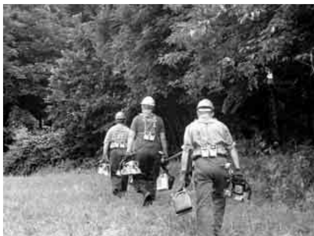
Figure 3 Cutter going to the felling site with driving device on its back Slika 3. Odlazak sječača u sječinu s pogonskim uređajem na leđima

The research was carried out in the mountainous part of Croatia (Litorić, Gorski Kotar) as shown in Figure 2 at an altitude of 750 m. The compartment is of an area of 22.77 ha with 70 % coverage. This stand is made of fir and beech with a total growing stock of 306 m 3 /ha of which fir accounts for 48.4 %, beech for 39.1 % and other hard-wood broadleaved species for 12.5 %. In the compartment 465 trees were marked for felling with a mean volume of 1.71 m 3 , and the mean volume of fir was 1.81 m 3 .