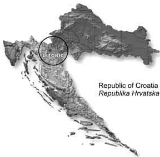
Figure 2 Site of research Slika 2. Prikaz mjesta istraživanja