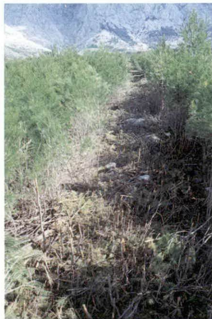
Photo 4. Removing strips of young Aleppo Pine trees ( Pinus halepensis Mill.) with a circular blade saw in Baško Polje

Fotografija 3. Gusti pomladak alepskoga bora ( Pinus halepensis Mill.) desetak godina nakon požara - Baško polje