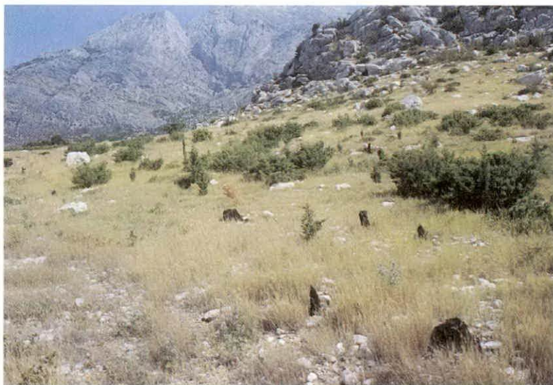
Photo 1. Test Plot 2 in Baško Polje - Fires in 1985 and 1988 Fotografija 1. Pokusna ploha u Baškom polju - požar 1985. i 1988. godine