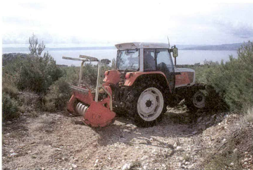
Photo 2. Circular blade saw Steyr Forst 9078 on the site in Baško Polje (March 3 1995) Fotografija 2. Rotacijski čistač STEYR FORST 9078 u radu u Baškom polju (6.3.1995.)