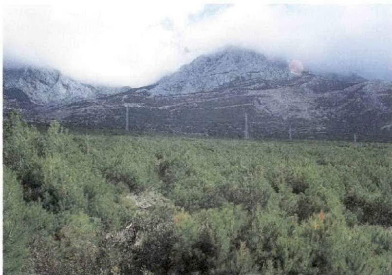
Photo 3. A thick young growth of Aleppo Pine ( Pinus halepensis Mill.) a decade after the fire - Baško Polje

Fotografija 3. Gusti pomladak alepskoga bora ( Pinus halepensis Mill.) desetak godina nakon požara - Baško polje