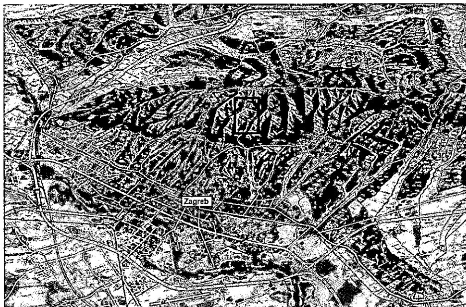
Figure 1 Adolfovac area.